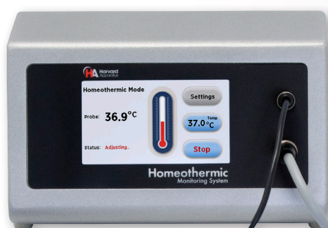
Control Unit with Probe and Blanket