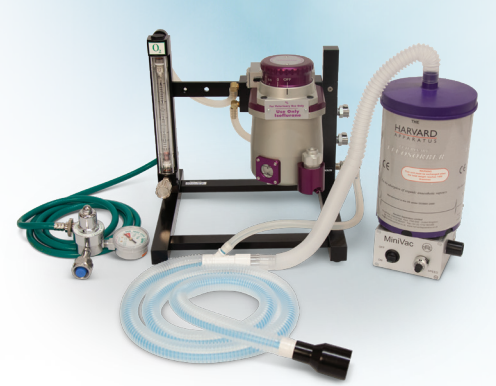
Tabletop Anesthesia System with MiniVac Active Scavenging