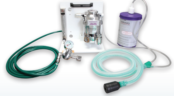
Harvard Apparatus Single Animal Isoflurane System