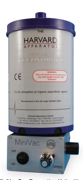
MiniVac Gas Evacuation Unit with Fluosorber Canisters