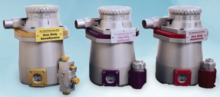
Cage Mount type Vaporizers