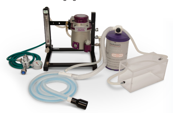
Tabletop Anesthesia System with Induction Box and Passive Scavenging