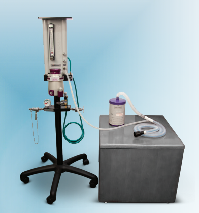
Mobile Anesthesia System with Passive Scavenging (table not included)