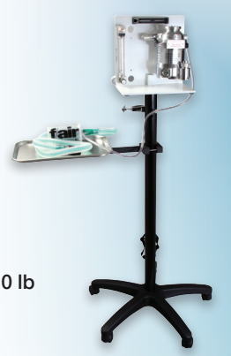
Harvard Apparatus Mobile Single Animal System