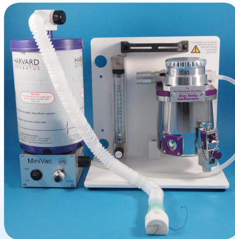
Anesthesia Setup with MiniVac