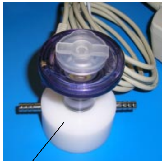
73-3734 LOW DEATH VOLUME ADAPTER FOR ULTRASONIC NEBULIZER, death volume 1.5ml

WITH FILLER CAP (particle size VMD between 2.5 - 4.0 µm), filler cap opened